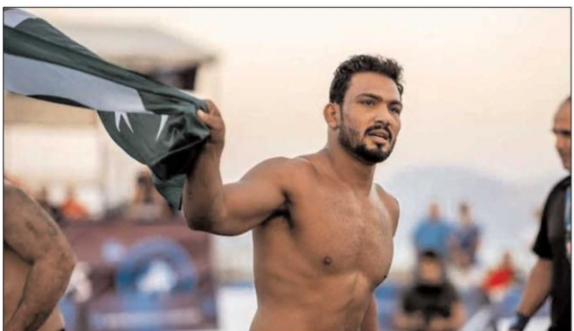
April 21 to 30 in Sanya.

The Pakistan Olympic Association expressed confidence that the contingent would uphold the country's sporting spirit at the event.