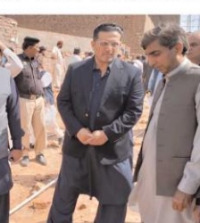
KPEZDMC Head Office also arrived promptly on the instructions of the CEO to oversee the situation. On the 17th April, CEO

and relief operations. Senior management from