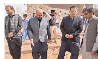
Commissioner (DC), Assistant Commissioners (ACs), and Rescue 1122 reached the site and actively supported rescue

the incident, teams from KPEZDMC, the Deputy