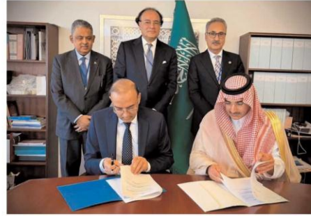
presence of the... pic.twitter.com/zBCoAWPH NL — Ministry of Finance,

Government of Pakistan (@Financegovpk) April 17, 2026 Pakistan appreciates