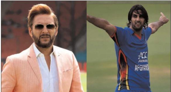
Afghanistan pacer Shapoor Zadran.

Zadran retired in 2025 after a career spanning more than a decade, during which he played a key role in Afghanistan's rise in international cricket.