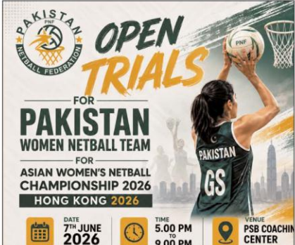
from August 7 to 16 in Hong year as it also serves as the

Women's Netball Championship, scheduled Kong. The continental event carries added significance this