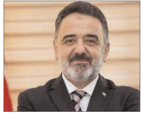
On the occasion, ICCI President

cooperation to enhance com- munities in diverse sectors. Speaking